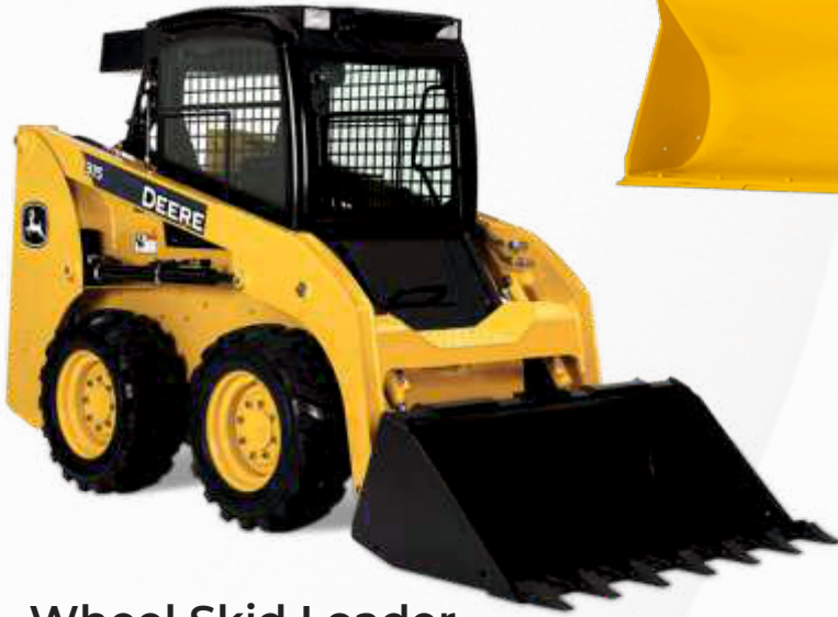
Wheel Skid Loader